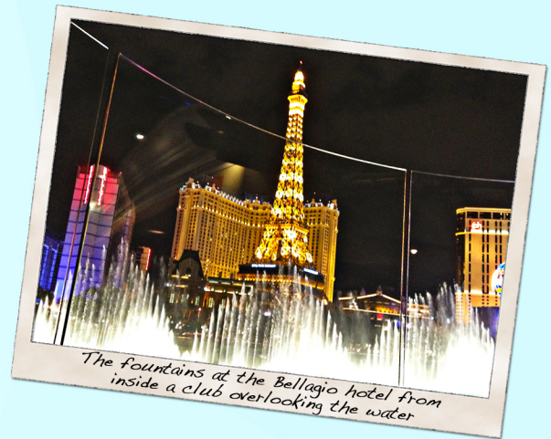
The fountains at the Bellagio hotel from inside a club overlooking the water

Nor do we need to ask the court to challenge a particular potential juror 'for cause' since there are certain instances, as here, where a potential juror would be immediately disqualified and not be permitted to sit on this type of case.