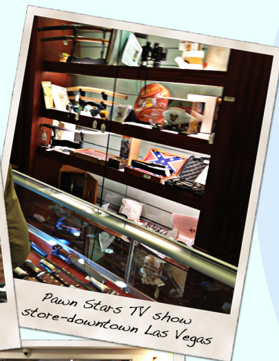
Pawn Stars TV show store-downtown Las Vegas