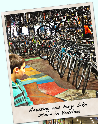
Amazing and huge bike store in Boulder