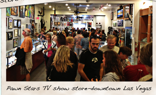
Pawn Stars TV show store-downtown Las Vegas

NEW YORK INJURY TIMES - ARE YOU QUALIFIED TO SIT AS A JUROR?