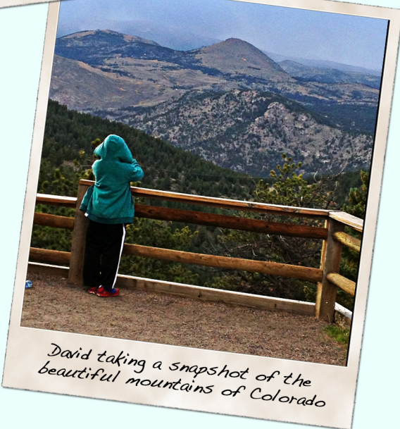
David taking a snapshot of the beautiful mountains of Colorado