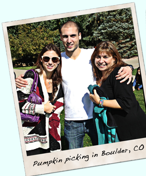
Pumpkin picking in Boulder, CO

As part of the decision the jury will have to evaluate different subcategories of damages you suffered. This would include past pain and suffering, future pain and suffering, medical expenses you incurred in the past, medical expenses in the future, lost earnings, future lost earnings as well as other types of economic and noneconomic damages.