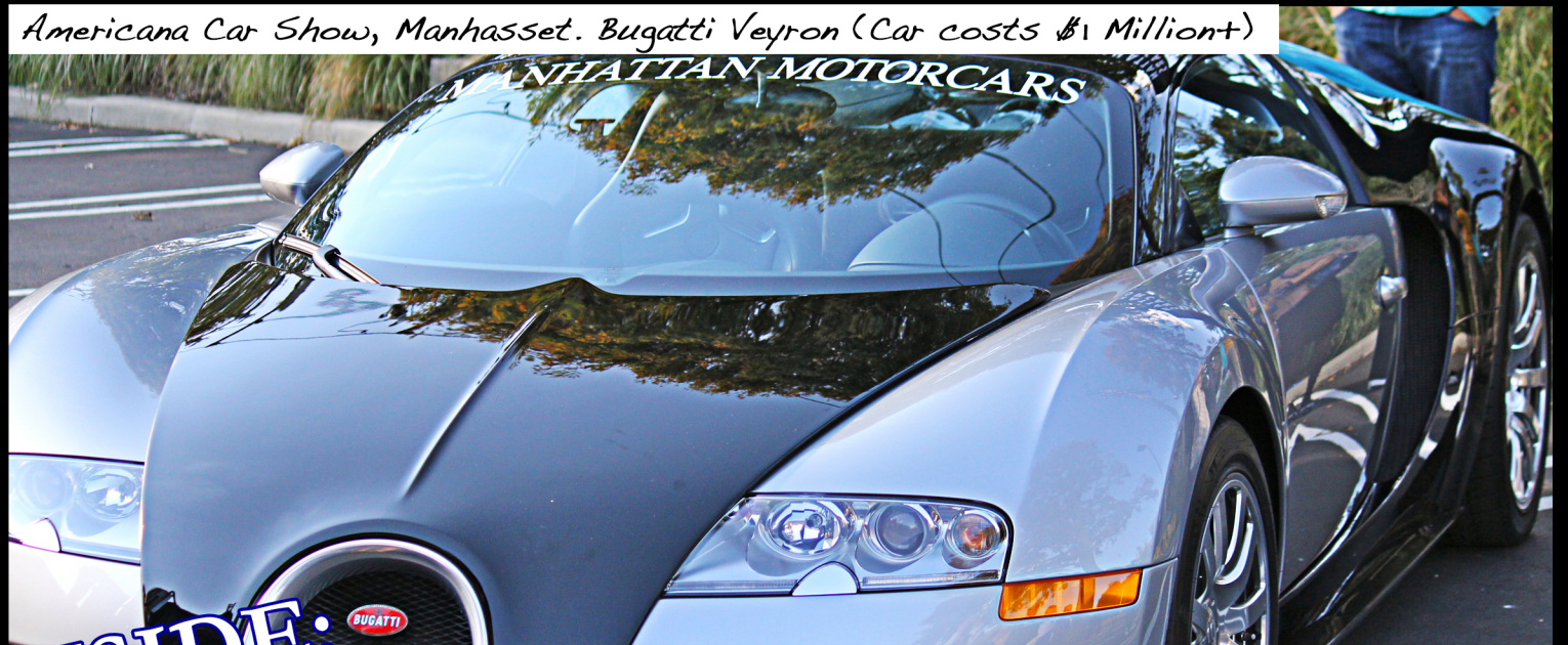
Americana Car Show, Manhasset. Bugatti Veyron (Car costs $1 Million+)