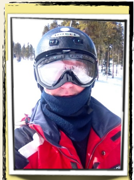
Skiing in Colorado. That's me above, all bundled up. The photo below is absolutely remarkable. Blind skier w/ guide.

Instead, we need only show that we are more likely right than wrong.