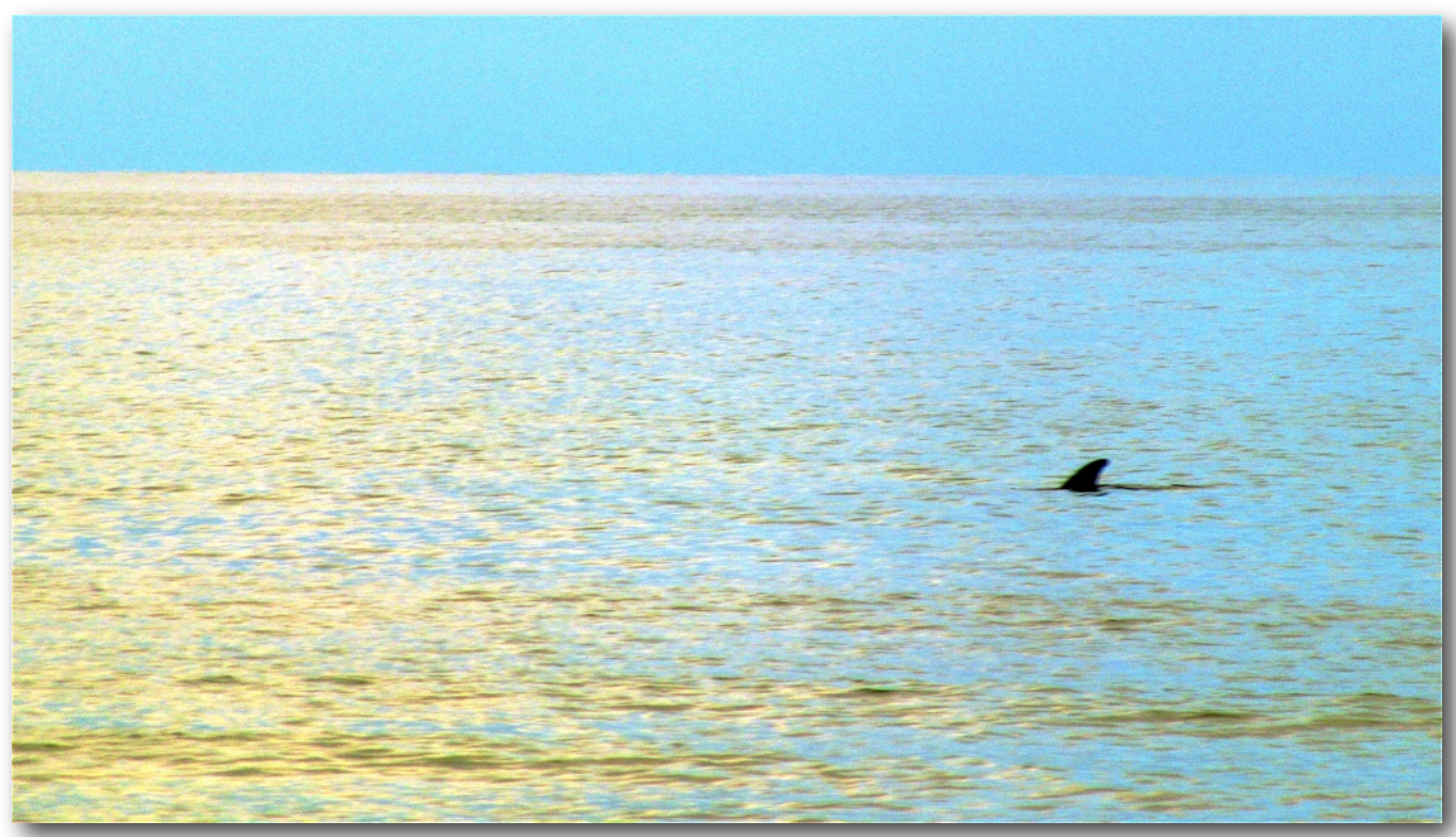
A dolphin swimming by our hotel. Yes, it's a dolphin and not a shark. It kept coming up for air.