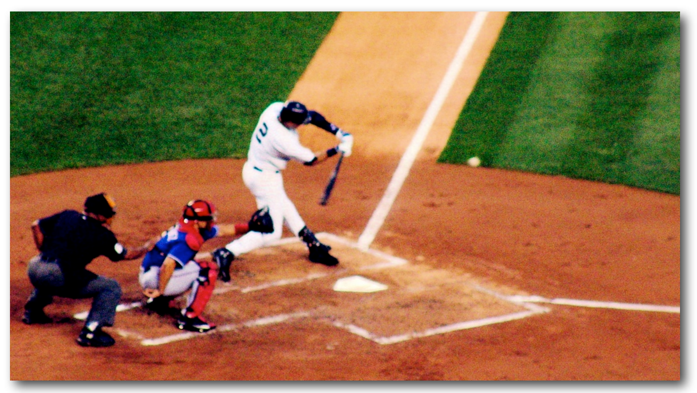
The Yankees at bat at the new stadium. What do you think? A hit or a strike?