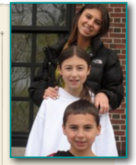
Harvard University library steps

A: That is a concept that lawyers use to explain that your injuries caused you pain, suffering, and literally the loss of enjoyment of your daily life. This allegation of loss of enjoyment of life is included within any claim for pain and suffering you may have. We would point