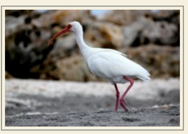
A hungry heron on Sanibel Island, Florida. Notice the background is blurry but the bird is in perfect focus? That's known as depth of field.

NY Injury Times, 25 Great Neck Road, Suite 4, Great Neck, NY 11021 | 516-487-8207 | www.Oginski-law.com