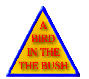
Read this. Then read it again. Then count how many times you see the word "The."